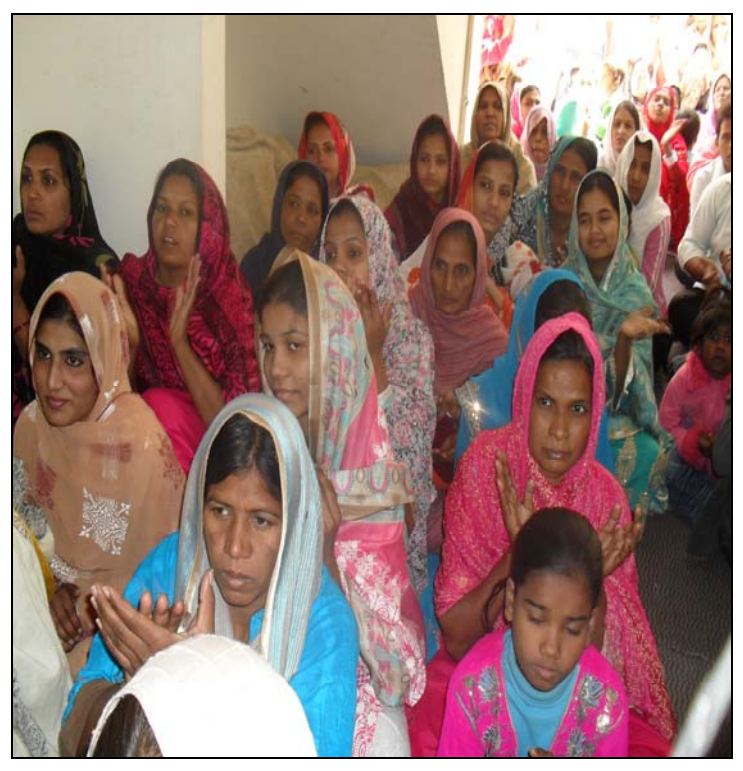
Sisters are worshiping at Pak Tabernacle

Pak Tabernacle Pakistan is greatly and highly thankful to you for your precious prayers; love, tireless efforts and support for the work of God in this Islamic country .God bless you, your Precious ministries and families. We highly valued and appreciated you for your great burden and love for the bride of Christ around the globe and especially in Pakistan. We at Pak Tabernacle Church have planned to extend our church building for the believers in Karachi. Kindly please keep our plans in your precious prayers. We greatly and highly appreciate and valued your precious prayers and your love for His kingdom. We are regularly praying for you, your family, your precious ministry and all the saints around you. May Lord Jesus Christ richly and abundantly bless you all and use you for His glory and honour around the globe. Our sincere and faithful prayers always with you and yours Kind best regards to you, your precious family and all the saints in Christ around you.